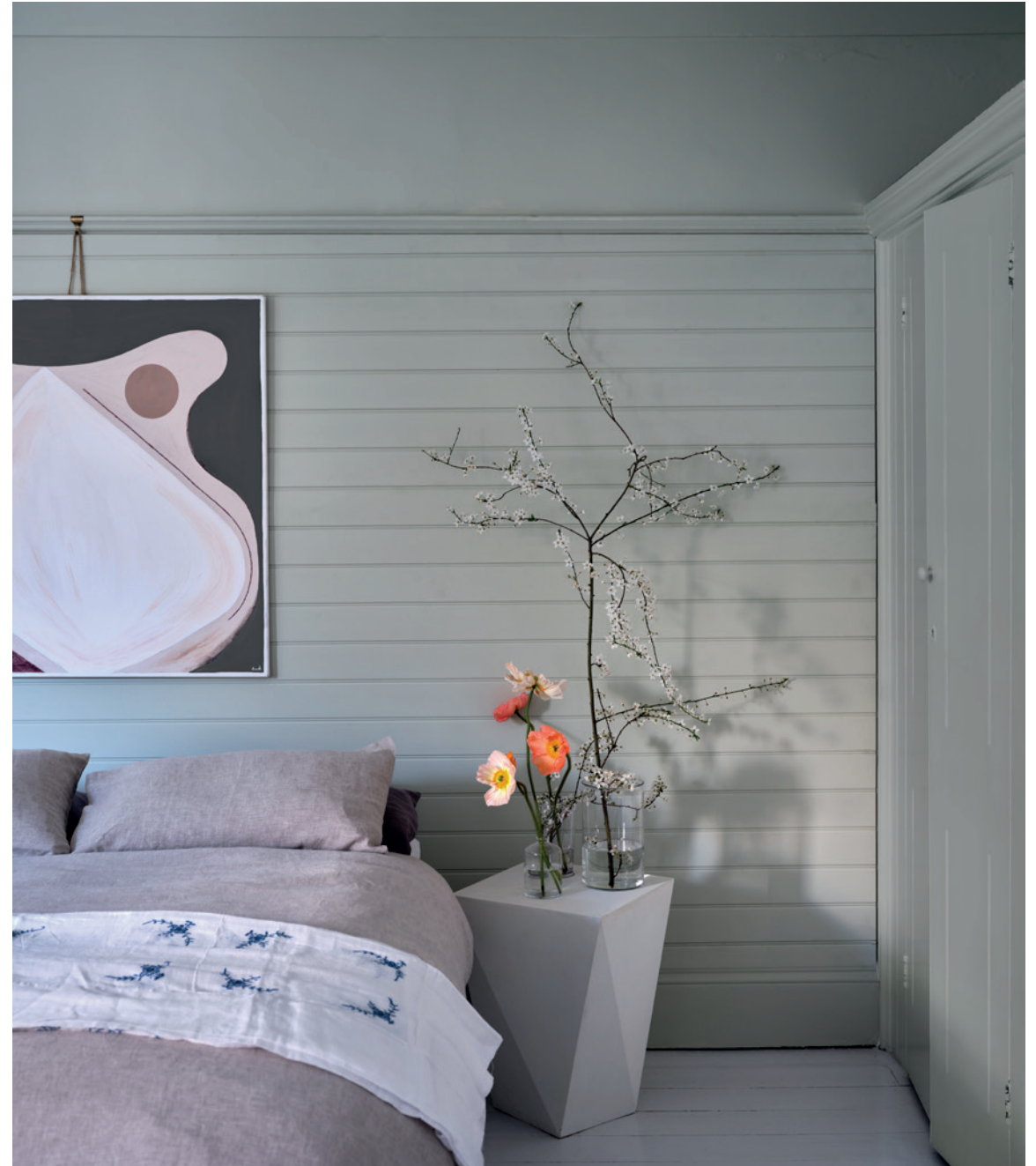
Walls: Eddy No.301 Estate Emulsion and Eddy No.301 Estate Eggshell, Woodwork: Eddy No.301 Estate Eggshell, Artwork: Laura Wickstead

Named after the circular currents enjoyed by wild swimmers as a natural jacuzzi, this is a lighter shade than French Gray – or a greener alternative to Cromarty.