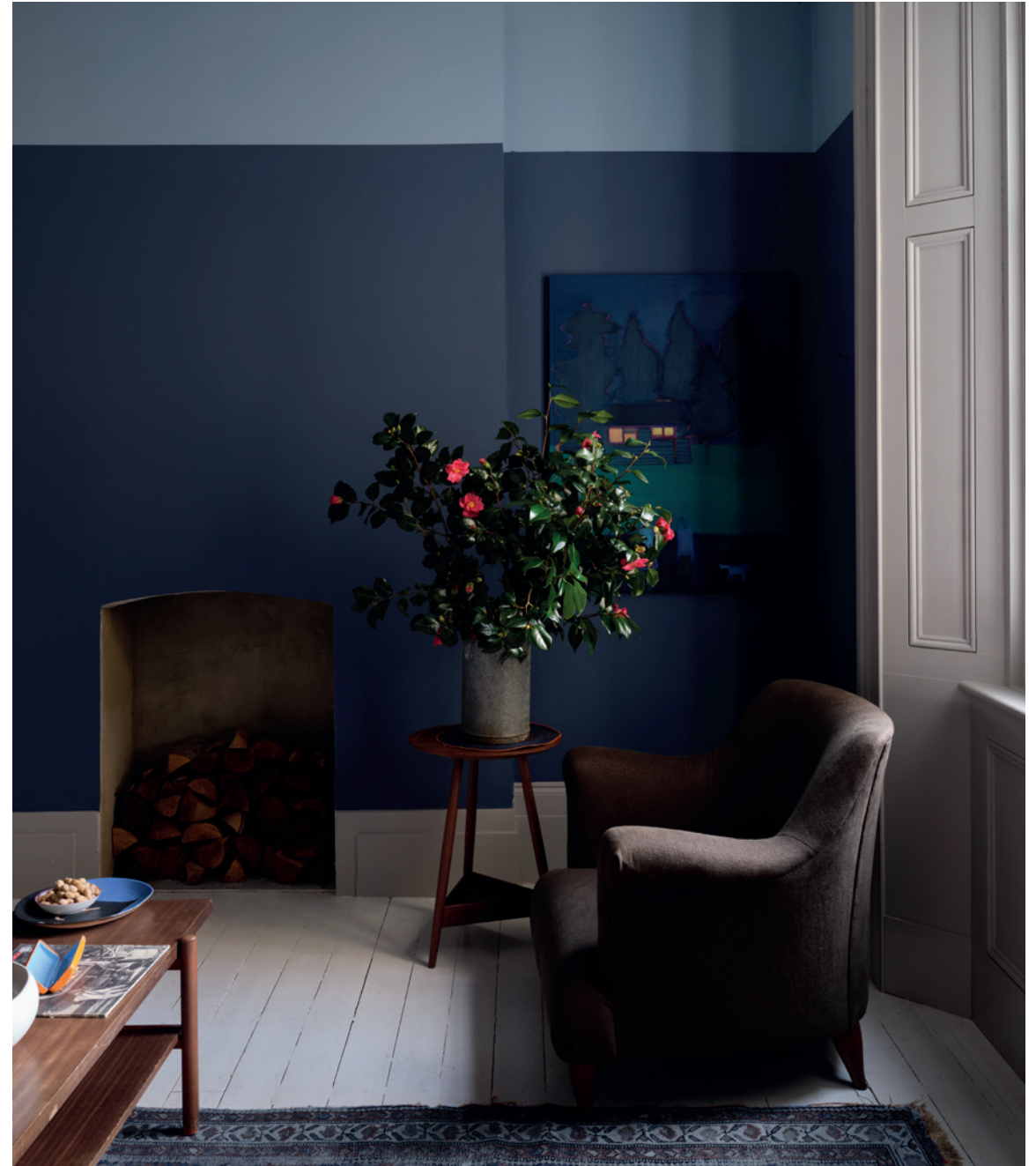
Walls: Wine Dark No.308 and Kittiwake No.307 Estate Emulsion, Woodwork: Purbeck Stone No.275 Estate Eggshell, Artwork: Tom Hammick

Inspired by midnight skies, this spiritual colour is named after the term Homer used to describe the sea, and is perfect to create an intimate space.