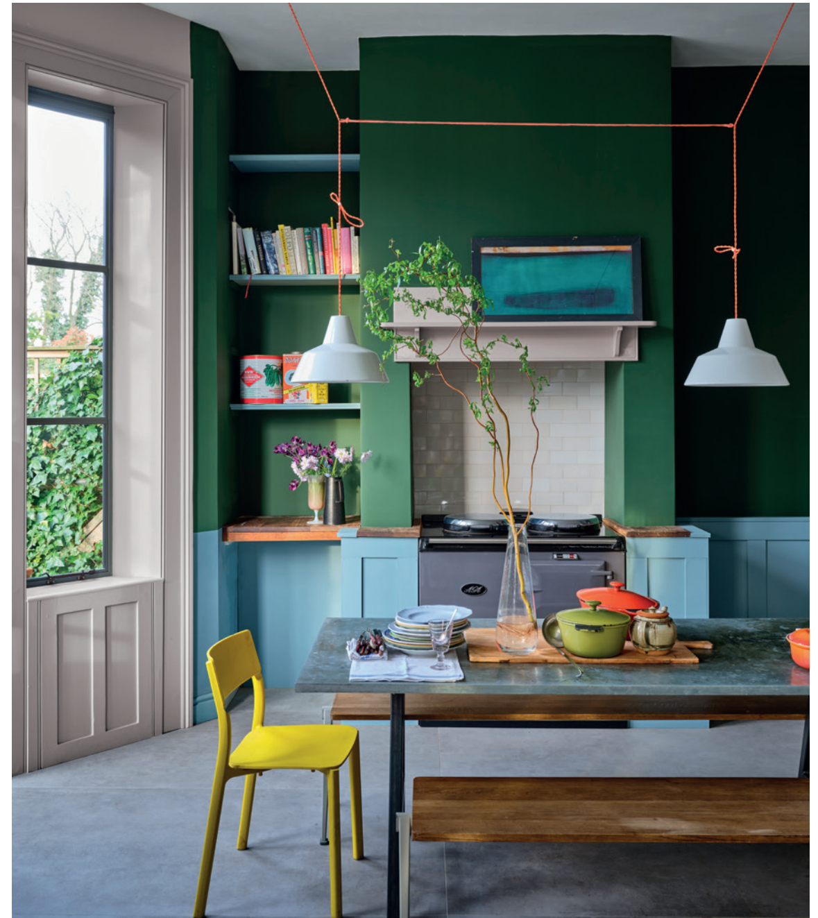
Walls: Beverly No.310 Modern Emulsion, Woodwork: Selvedge No.306 Modern Eggshell

A clean mid green, named in honour of a kind and generous member of our Farrow & Ball team who is sadly no longer with us.