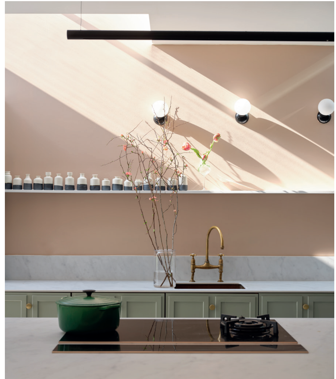
Walls: Templeton Pink No. 303 Modern Emulsion, Cabinets: Blue Grey No.91 Modern Eggshell, Ceramics: Margot Wilson

A historic-feeling pink, developed for the dining room at Templeton House to offset the magnificent Wedgwood plaques made to commemorate a former owner.