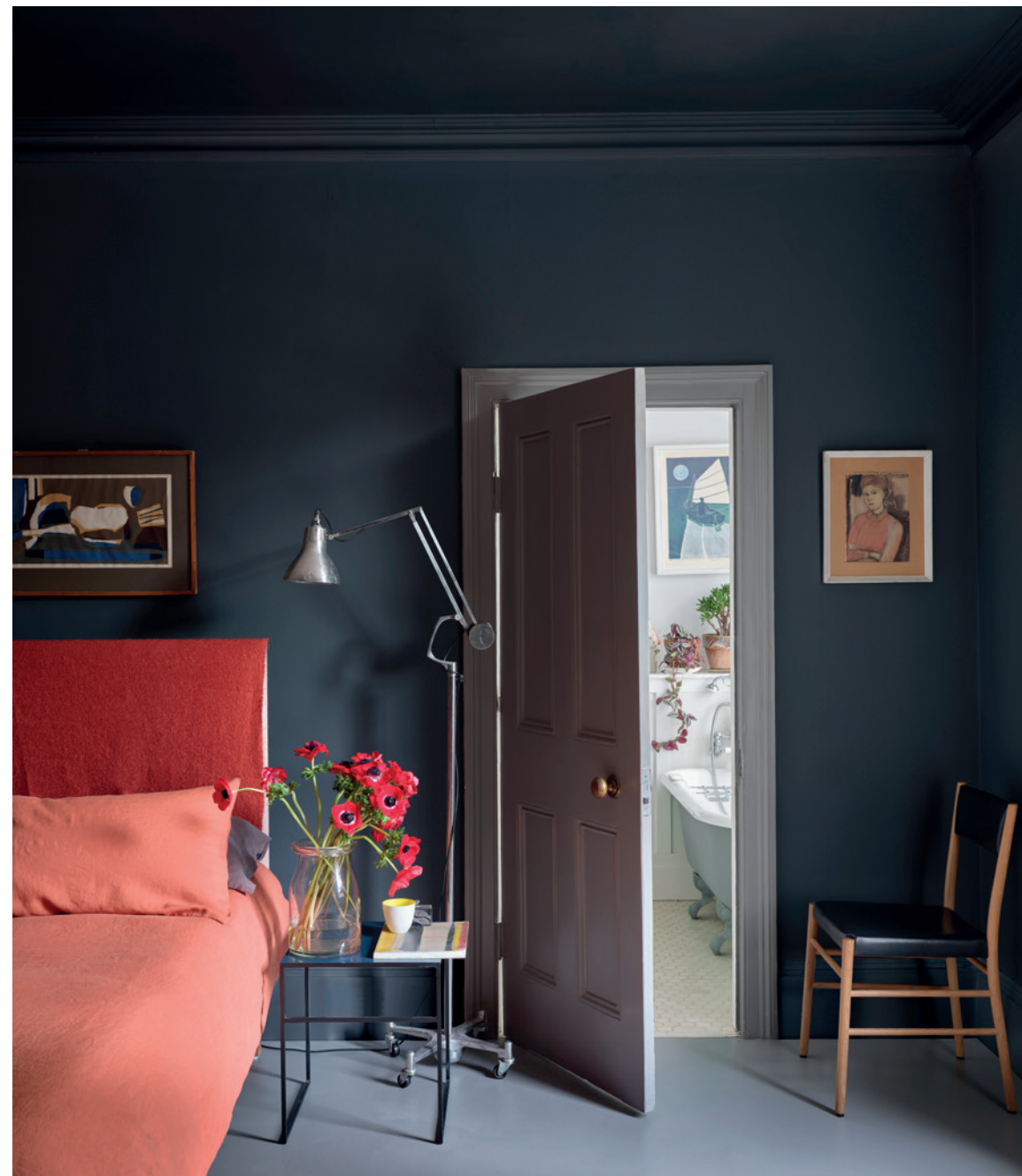
Walls and Ceiling: Hopper Head No.305 Estate Emulsion, Woodwork: Mole's Breath No.276 Estate Eggshell

Sitting between Railings and Down Pipe, this colour is inspired by the attractively designed iron containers used to catch rainwater at the top of a downpipe.