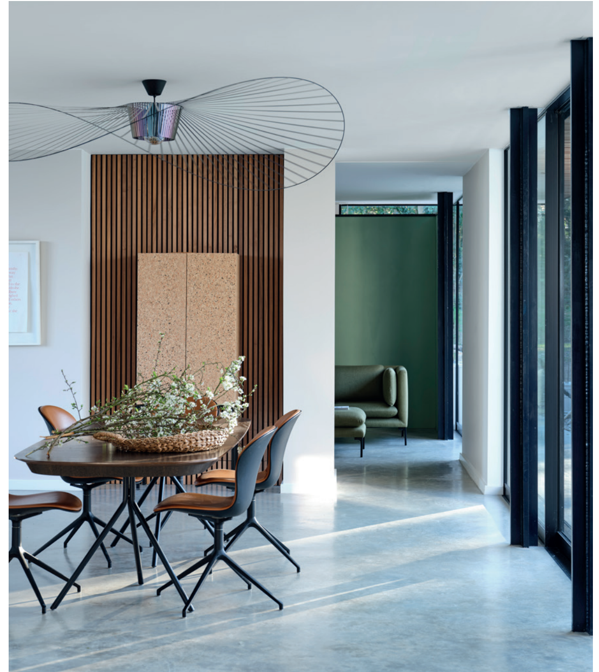
Walls: Stirabout No.300 and Beverly No.310 Modern Emulsion, Ceiling: Stirabout No.300 Estate Emulsion

This warm neutral with an underlying grey is inspired by the nurturing porridge favoured over many centuries in Ireland. A lighter version of sandy Jitney.