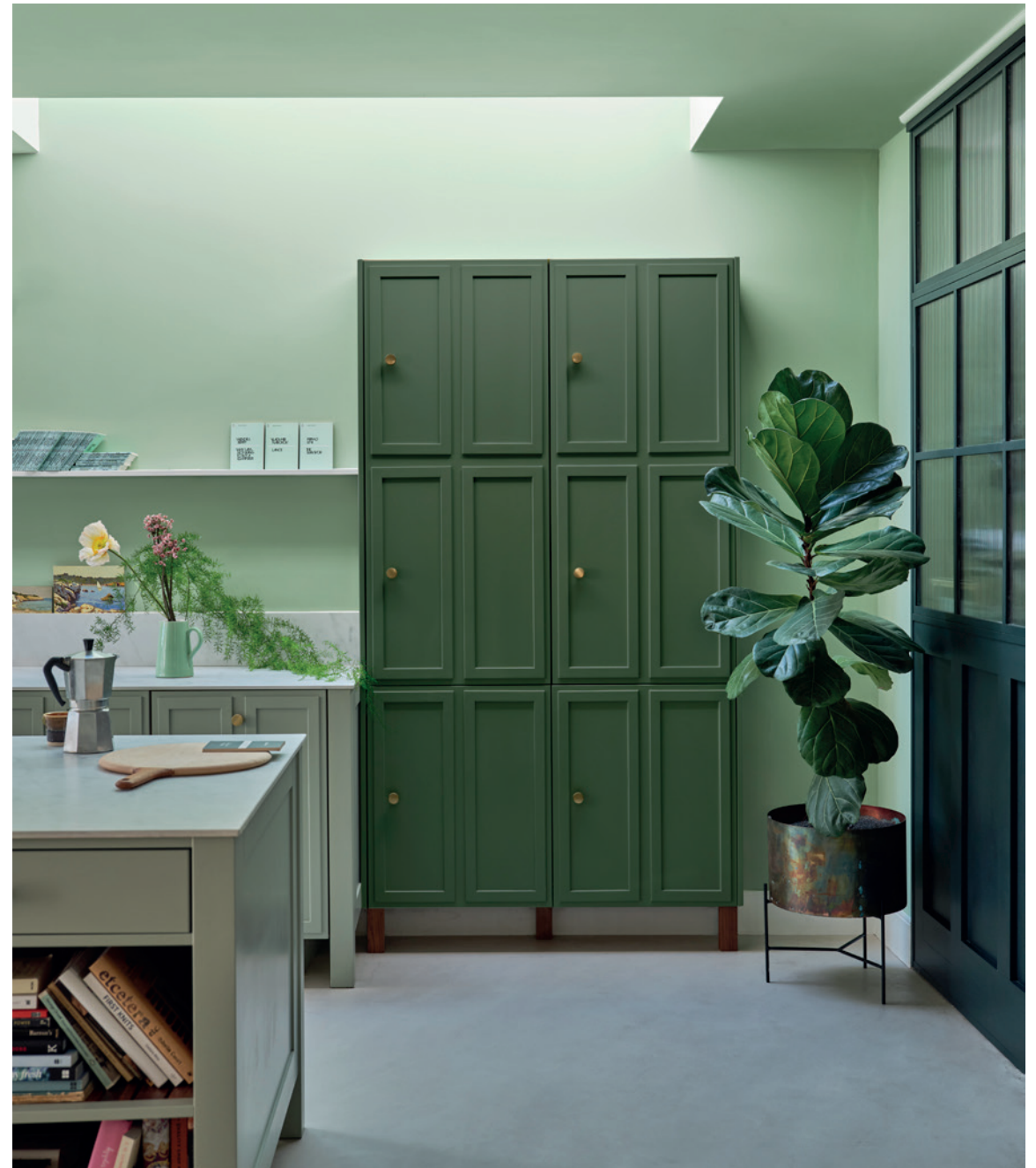
Walls: Whirlybird No.309 Modern Emulsion, Cabinet: Beverly No.310 Modern Eggshell

This softer version of Breakfast Room Green is inspired by the papery winged seeds beloved by many playful young gardeners and nature lovers.