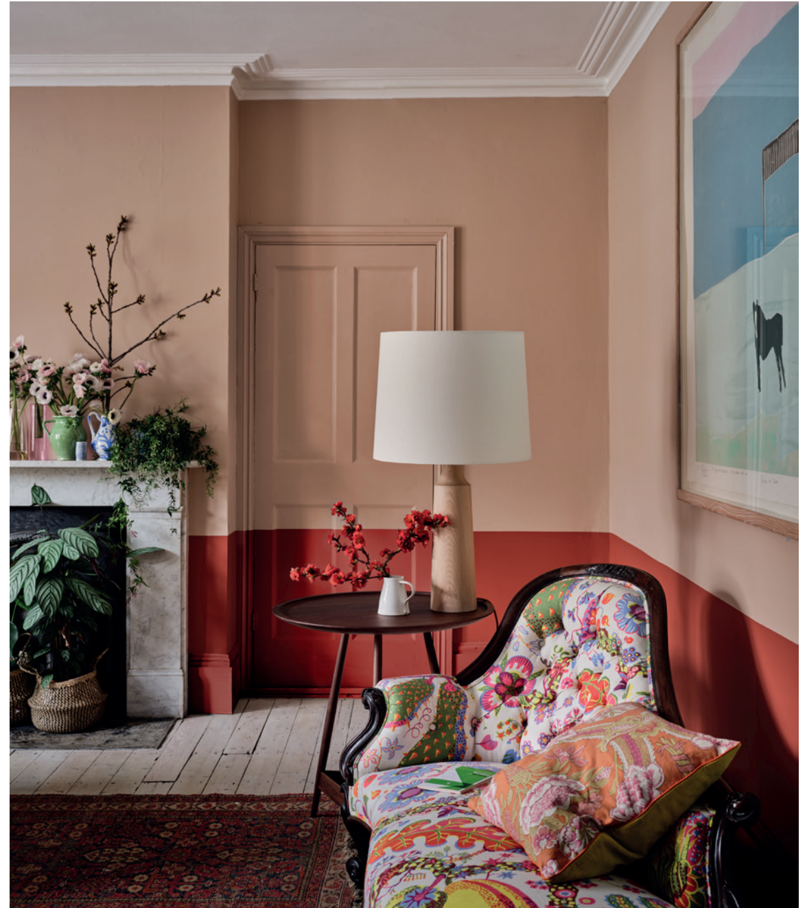
Walls: Bamboozle No.304 and Templeton Pink No.303 Estate Emulsion, Woodwork: Bamboozle No.304 and Templeton Pink No.303 Modern Eggshell, Artwork: Tom Hammick

The name of this flame-red hue was originally used to describe the deceit of pirates. Full of buccaneering spirit, it's perfect to add some joy to any room scheme.